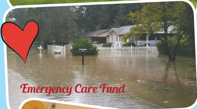
Emergency Care Fund